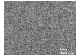
House fabric: Quicksilver (Other local fabrics available)

Wood swivel base model, durable die cast aluminium base with wood like finish powder coat in Beech colour Dimensions overall: 62cm W x 64cm D Seat: 52cm W x 51cm D Seat Height: 48cm H Back: 56cm W x 83cm H Armrest Height: 62cm H