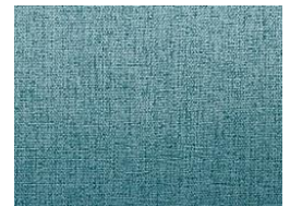
House fabric: Quickteal (Other local fabrics available)

Visitors model, High tensile steel rod diamond sled base powder coated in Black Dimensions overall: 62cm W x 64cm D Seat: 52cm W x 51cm D Seat Height: 48cm H Back: 56cm W x 83cm H Armrest Height: 62cm H