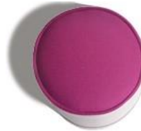
Top view – THIM-2

Dimensions: 48cm Dia x 49cm H Tapered top 42cm Dia (Two tone of fabric)