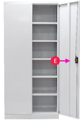
SC-Swing door Cabinet