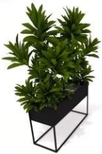
LA - 5 - B