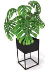
LA - 6 - B