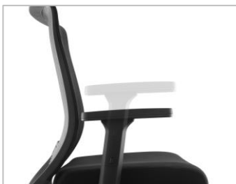
Height Adjustable Arms