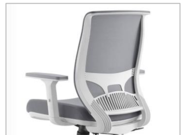
Dynamic Lumbar Support