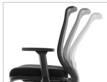
Synchro Mechanism With 3 Position Lock