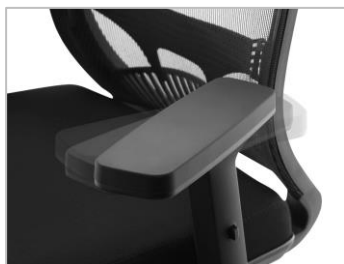
Pivotable Arm Pads