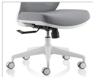
White Nylon base