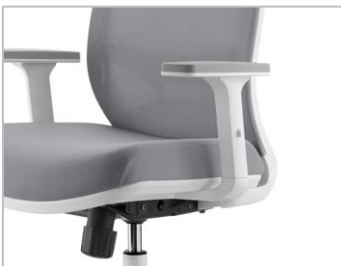
Pivotable Arm Pads