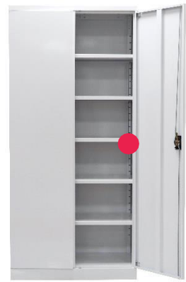
SC-Swing door Cabinet