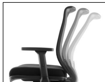
Synchro Mechanism With 3 Position Lock