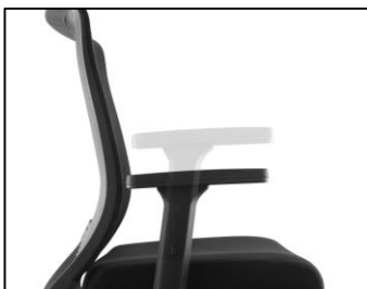
Height Adjustable Arms